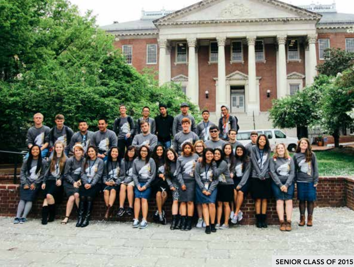
SENIOR CLASS OF 2015