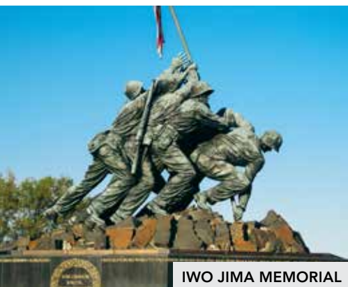
IWO JIMA MEMORIAL